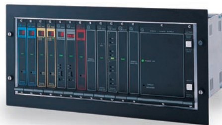
A 16 -channel chassis with assorted monitors, facilitating module and optional 24 VDC power supply.*

Zero Two Series systems are extremely easy to install. The only field connections required are inputs from the sensors to the card modules and the outputs from the control/shutdown system, DCS, PLC, beacons, horns etc. Zero Two Series components come with a two year warranty.